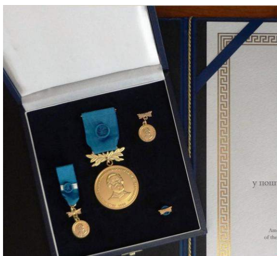
Medal “For Significant Contribution to the Spreading of the Idea of Unity of Europe”