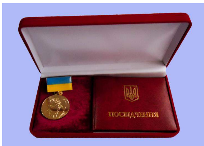
Hryhorii Skovoroda Medal (SHEI “Pereyaslav-Khmelnyskyi Hryhorii Skovoroda State Pedagogical University”)